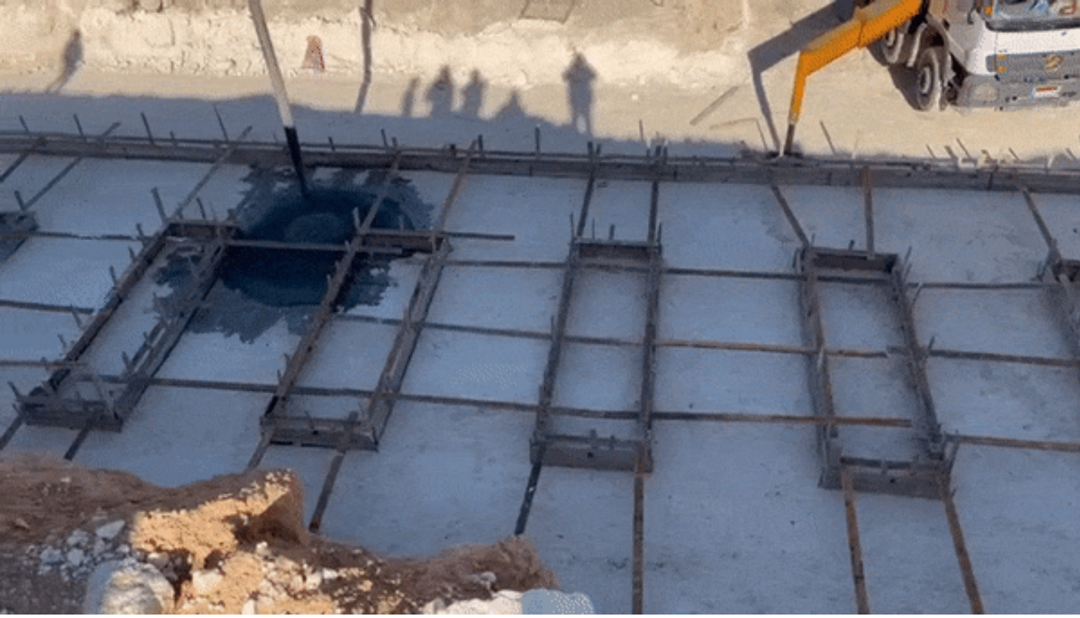
STARLIGHT DEVELOPMENTS assigns REDCON Construction for the construction of Katameya Coast, See the Sea with a total investment of EGP 3 billion.